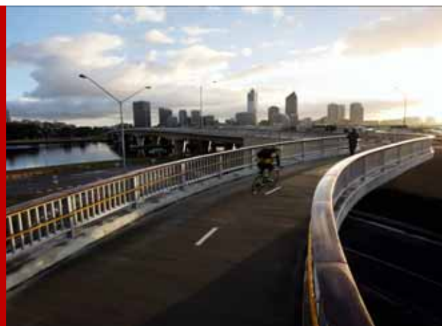
Austroads Annual Report 2009-10