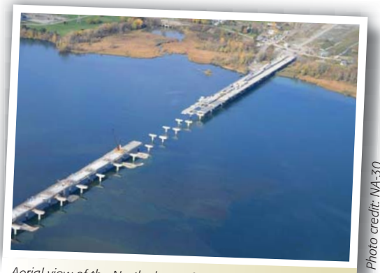
Aerial view of the North shore of the St. Lawrence Bridge.

We thank you for your interest in the completion of Autoroute 30.