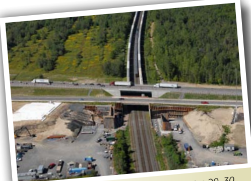
Construction of the interchange of Autoroutes 20, 30 and 40