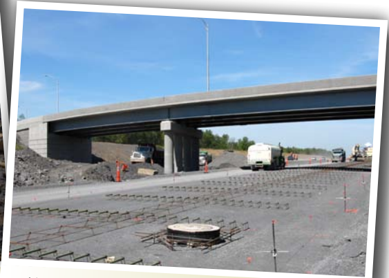
Building the concrete slab roadway of the Jean-Leman segment