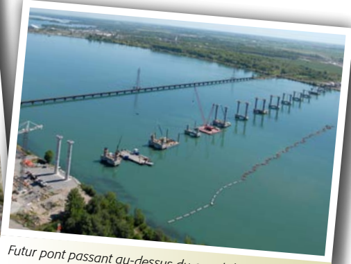
Futur pont passant au-dessus du canal de Beauharnois