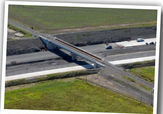
Construction of Autoroute 30 overpasses crossing over Chemin Candiac

In the next few weeks, construction of these two overpasses, the pumping station and the concrete road surface, as well as the earthworks, will be completed. Finally, workers will connect this new segment with the lanes of the existing Autoroute 30.