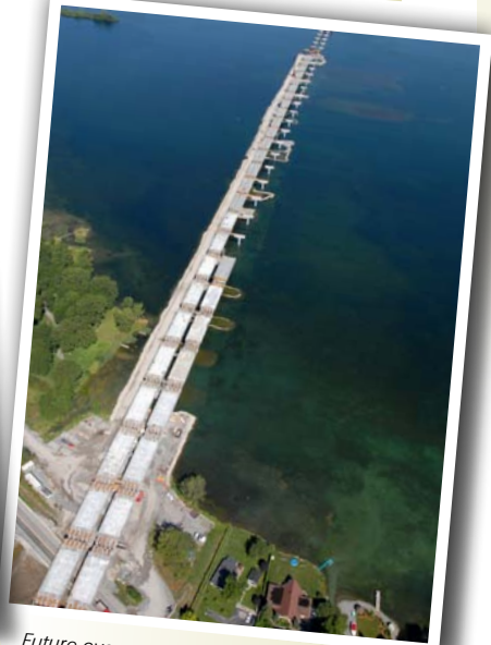
Future overpass crossing over the Saint Lawrence River