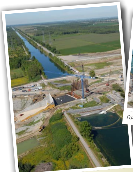
Construction of the tunnel passing under the Soulanges Canal

Some worksites on Autoroute 30 are located close to traffic lanes, and the workers on some sites are in daily contact with highway users. The Ministère is, therefore, urging you to be vigilant at all times when you approach the worksites.