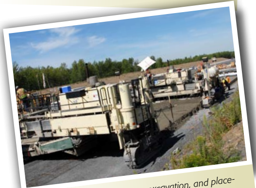
Construction of road surfaces, excavation, and placement of stones to the East of the railway overpass