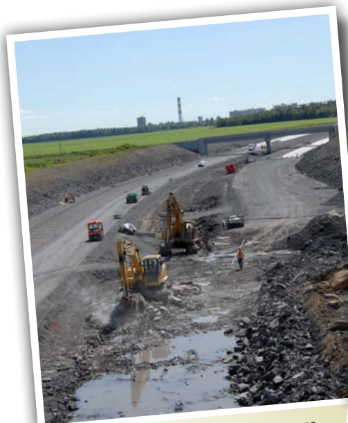
CP railway overpass, crossing over Autoroute 30