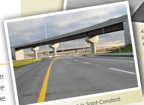
The 30/730 interchange in Saint-Constant.