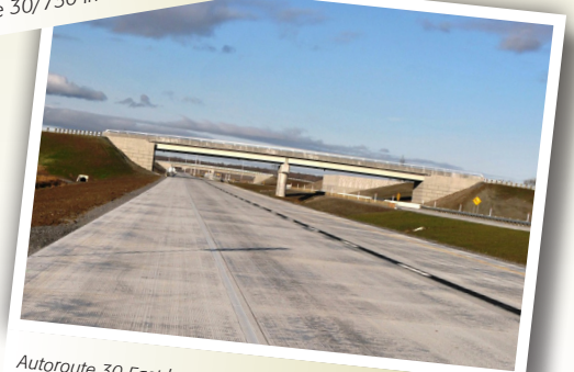
Autoroute 30 East located east of the Rang Saint-Régis South overpass.