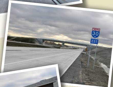
Autoroute 30 East located east of the Rang Saint-Régis South overpass.