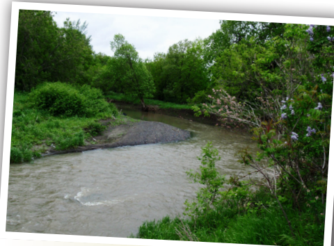
Rivière de la Tortue.

Much work will thus be undertaken to create 4,450 m 2 of new fish habitat, which will allow spawning in calm waters and the population growth of various species. This project will be carried out in two phases. The first, which will begin in the fall of 2010, consists of designing a canal network for fish on the riverbank, north of Route 132. The second phase of the project will take place south of Route 132, and will include re-establishing water circulation in a branch of the river currently obstructed by sand and gravel. This phase of the project, which is scheduled for 2011, will also include the design of a bass spawning ground.