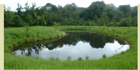
New pond at the Centre écologique Fernand-Séguin.