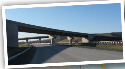
Work on the 30/730 interchange was completed in October 2009, including three overpasses and three ramps.