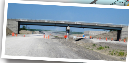
Rang Saint-Régis Sud overpass crossing Autoroute 30. This overpass and the Rang Saint-Régis Nord overpass have been completed.