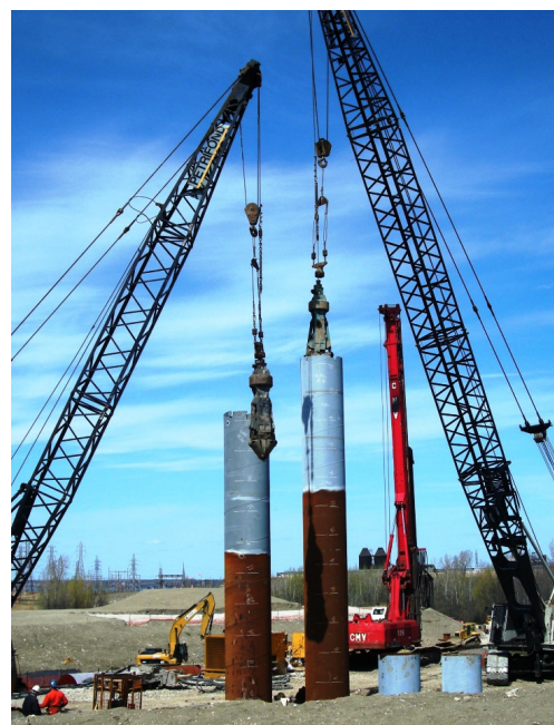
Installation of piers along axis 1 of the Route 236 overpass that will cross the CSX rail line.

Since the beginning of Phase 2 of the relocation of Route 236 in Beauharnois in May 2009, road fill and drainage work has been completed, along with the installation of culverts. Since the winter, workers have mainly been working on construction of the Autoroute 30 overpass over the CSX tracks. In fact, the team has been drilling and installing large piers for the construction of bridge abutments since March 2010. Construction of abutments and piers will go on during the summer season. Work on this site will continue until the fall of 2011.