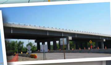
Autoroute 30 bridge crossing Rivière de la Tortue, from Montée de la Saline to Rang Saint-Ignace. The finishing touches remain, including installation of the safety barriers and approach slabs, and paving work.