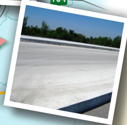
Preparation for installing the concrete for the pavement slabs between Rue Saint-François-Xavier and Autoroute 15.