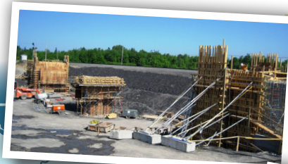
Construction of abutments and piers for the Canadian Pacific rail line overpass. Autoroute 30 is situated in a depression at this location, and will pass under the bridge.