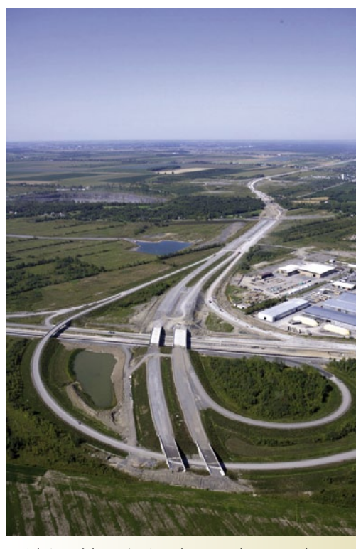
Aerial view of the 15/30 interchange at the approaches to the municipalities of Delson and Candiac.

We invite you to visit our website at www.autoroute30.qc.ca to see photographs of the different job sites on the East part.