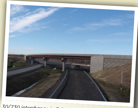
30/730 interchange in Saint-Constant.

Construction of the 30/730 interchange was completed this past October. This major project consisted of three large-scale job sites in the East part. The work, which was located in the Saint-Constant sector, had begun in summer 2008. It included construction of three overpasses and three ramps, as well as civil engineering work for lighting.