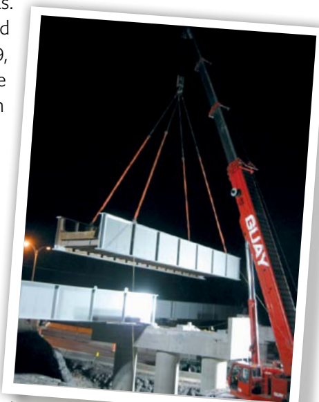
Placing a slab on the permanent CP railway overpass.

Over the past few months, the MTQ completed construction of a railway overpass over Autoroute 15 in Candiac. A temporary overpass was built during the last year so that the structure could be completely rebuilt. The new overpass includes six distinct sections and two tracks. The last track was installed on September 8, 2009, which completed the structure, and Canadian Pacific has installed the rails. The temporary line was demolished in September after the new overpass was opened to traffic.