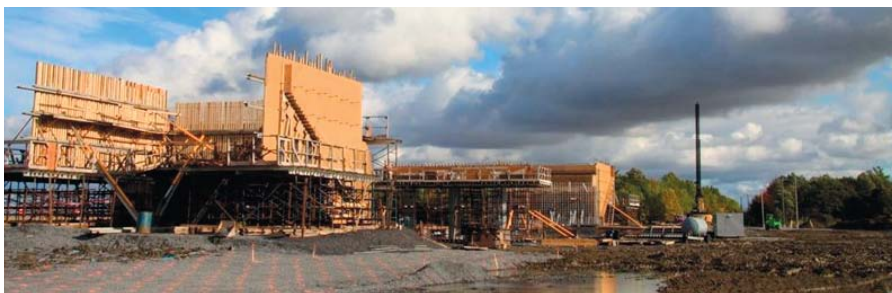
Overpass crossing Autoroute 30 at Montée Bellevue.

for construction of the Autoroute between Vaudreuil-Dorion and Châteauguay. For more information concerning this work, please visit consortium's Website: www.na30.ca .