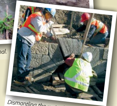
Dismantling the water intakes.