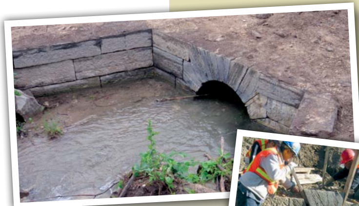
Water intake belonging to the old Beauharnois canal.

The two intakes were dismantled for the purpose of preserving their heritage. Before proceeding with the work, the specialists drafted a drawing of these two structures so that they could be rebuilt as faithfully as possible. The watercourse was then drained in order to assess the state of the culverts. During the dismantling operation, each stone was meticulously numbered so that it could be compared to the drawing and then reconstructed at a later date.