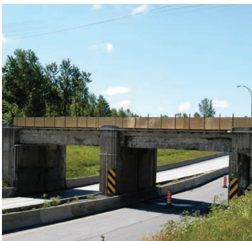
The Canadian Pacific Bridge must be completely overhauled as part of the work on the 15/30 interchange.

In 2007-2008, construction will take place on a temporary bridge to detour the railway lines; a project that is estimated at $4 M. The work will begin in October and is expected to be completed in June 2008.