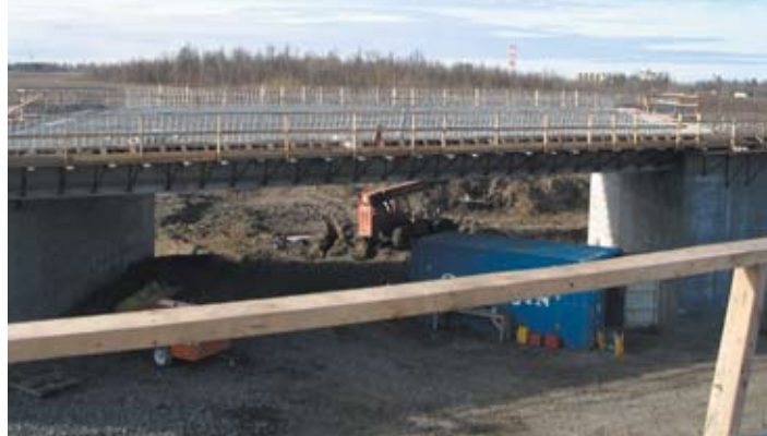
Work on the 15/30 interchange resumed in early 2007 and will continue until the fall.

Work on the site of the future 15/30 interchange near the municipalities of Delson and Candiac has resumed.