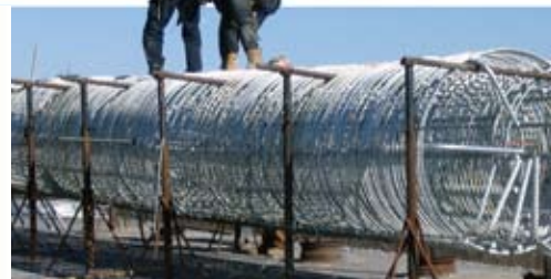
Workers on the structural elements of the stratification bridge

The initial mandate, which included preparatory work, has been completed. This work primarily entailed building access roads and preparing the site for the future 15/30 interchange and for upcoming work on the Jean-Leman segment. Among other things, the mandate included the relocation of certain public services that were located along Autoroute 15, securing access to adjacent industrial land, construction of access routes to future worksites, drainage of the worksite zones, and traffic management.