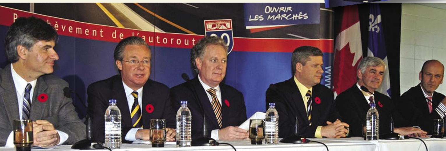
From left to right: Jean-Marc Fournier, Québec Minister of Education, Recreation and Sport and the Minister responsible for the Montérégie region; Michel Després, Québec Minister of Transport and the Minister responsible for the Capitale-Nationale region; Premier Jean Charest; Prime Minister Stephen Harper; Lawrence Cannon, Minister of Transport, Infrastructure and Communities Canada; and Michael M. Fortier, Minister of Public Works and Government Services Canada.