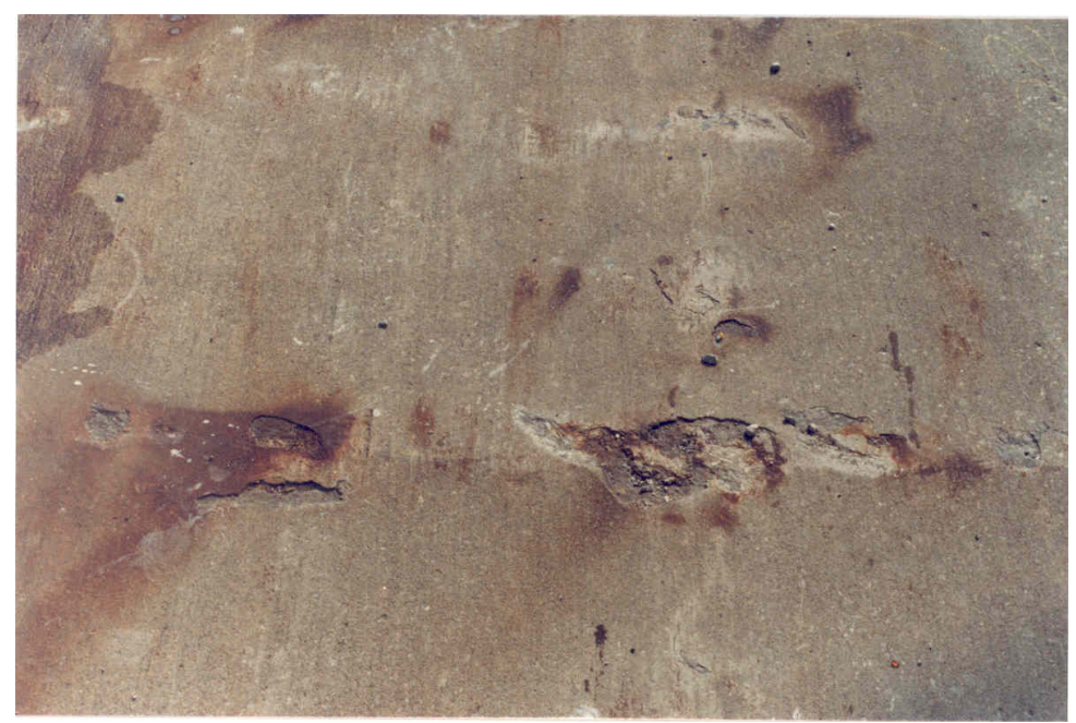
Figure 2 QEW WB to Highway 427 SB Ramp Deck Top Condition (Photo taken 1989)

In 1996, the MTO Structural Office undertook an investigation to evaluate the effectiveness of waterproofing membrane on bridge decks where the membrane was installed as part of the original construction [3]. The investigation involved analysing half-cell survey, sawn samples and chloride profile data for a total of 21 decks built in 1973 to 1978. The following is a summary of the findings: