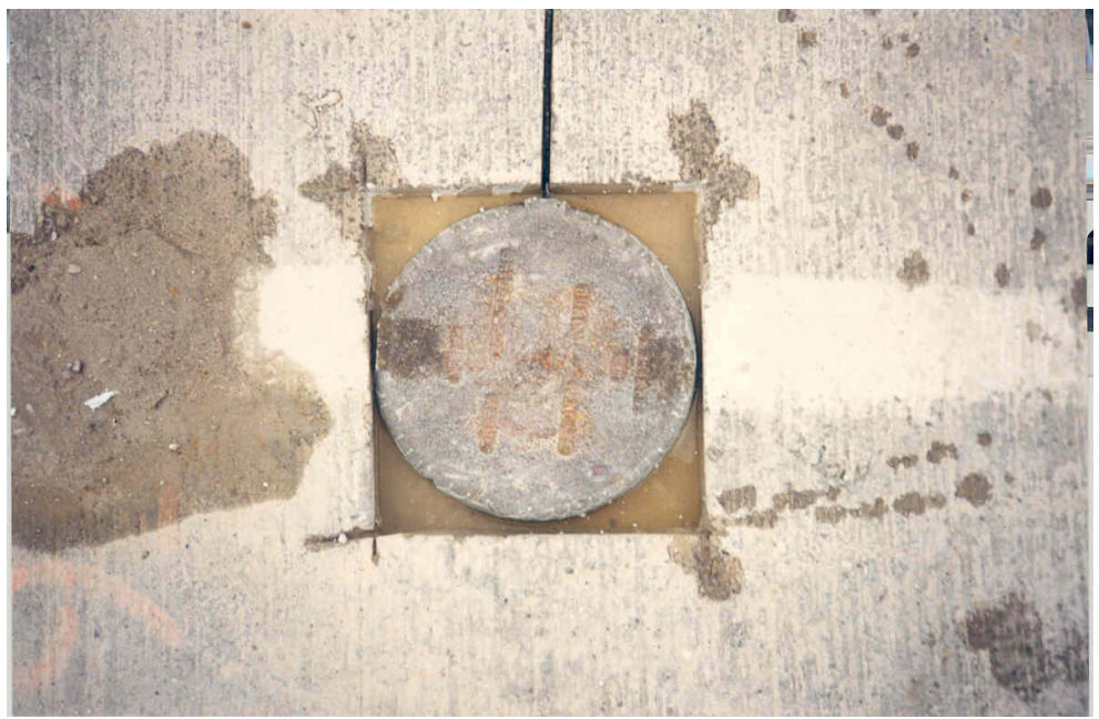
Figure 3 Pancake anode recessed into concrete deck

In 1974, the ministry installed the first conductive asphalt cathodic protection system on bridge decks based on the work by Stratfull [4] in California. It consisted of primary high-silica cast iron anodes recessed in the concrete surface and covered with a 40mm thick layer of electrically conductive cokebreeze asphalt; the conductive asphalt is then covered with a conventional asphalt surface course. This CP system can only be used on properly air-entrained concrete surfaces as the bridge deck cannot be waterproofed. Later on, from around 1990, this system has been used in conjunction with a normal concrete overlay to overcome the problem for decks where the existing concrete was not properly air-entrained. Figure 3 shows a typical pancake anode recessed in the top surface of a deck.