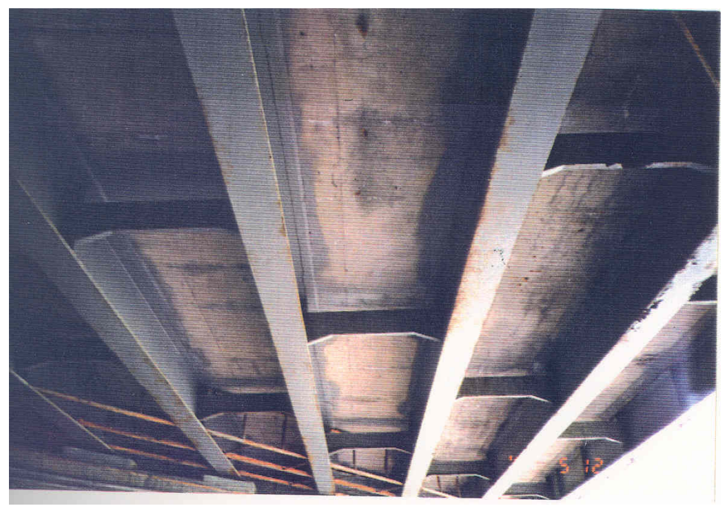
Figure 4 Soffit of Island Park Overpass, Hwy 417, taken in 1993