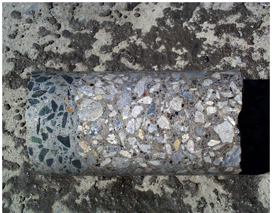
Figure 10 Core taken from deck with latex modified overlay