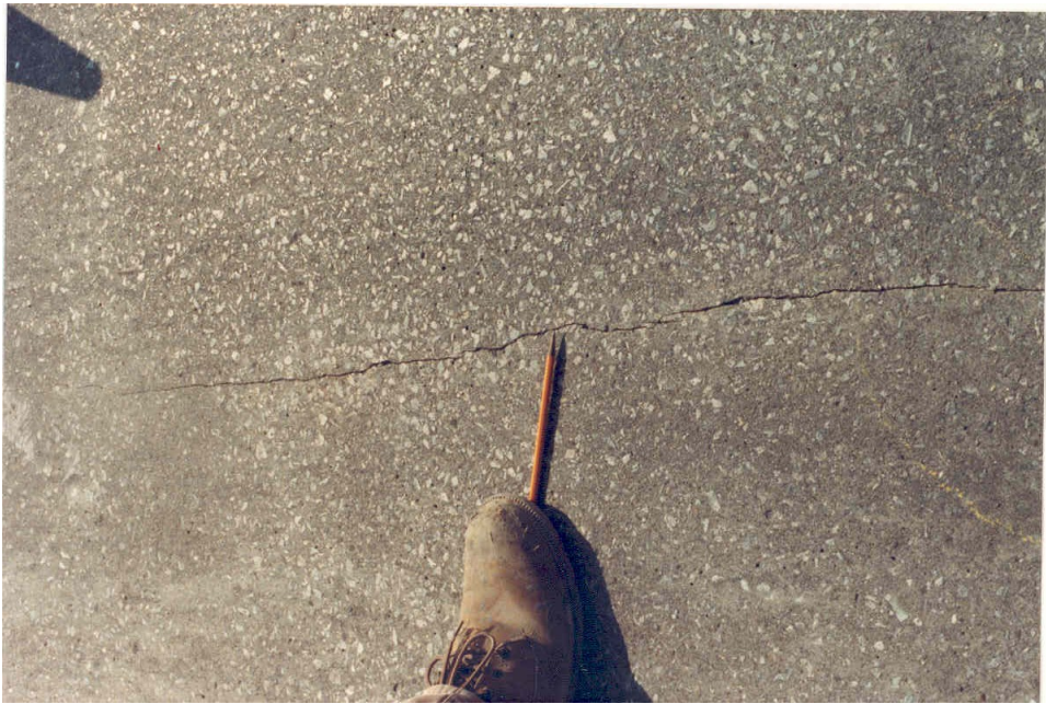
Figure 1 QEW WB to Highway 427 SB Ramp (Photo taken 1989) - Typical longitudinal crack in deck over voids