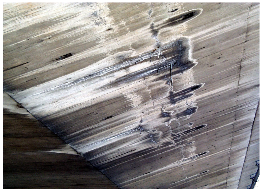
Figure 6 Soffit of Post-Tensioned Deck with leaching cracks