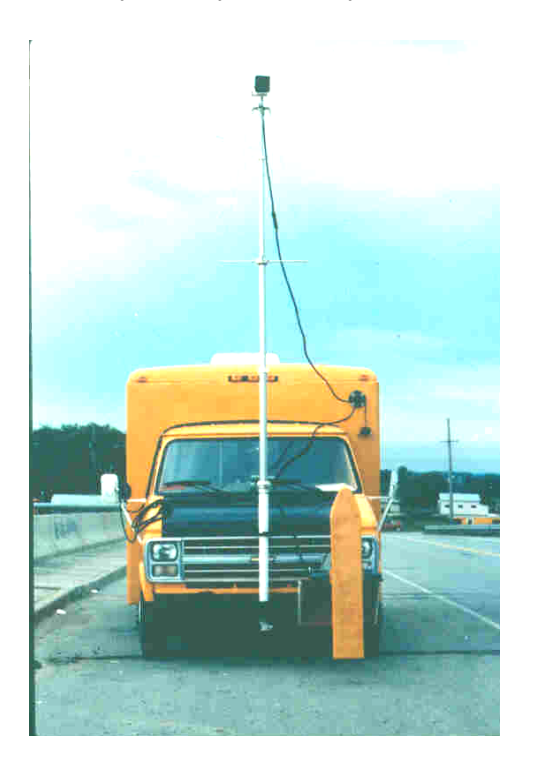
Figure 12 DART survey on decks

It was also recognised that the extent of delamination and severe scaling of an asphalt covered deck could not be assessed accurately by the cores and sawn samples, which only represent a very small percentage of the deck statistically. During this period, the ministry also acquired the deck assessment radar technology (DART) to pre-screen about 50 decks a year. The results of the DART survey (delaminations, severe scaling, cover to rebar) were co-ordinated with the half-cell survey to arrive at the appropriate rehabilitation treatment. Figure 12 shows the DART antenna with an operational frequency of 1 GHz, mounted on an MTO cube van ready to carry out survey of a deck.