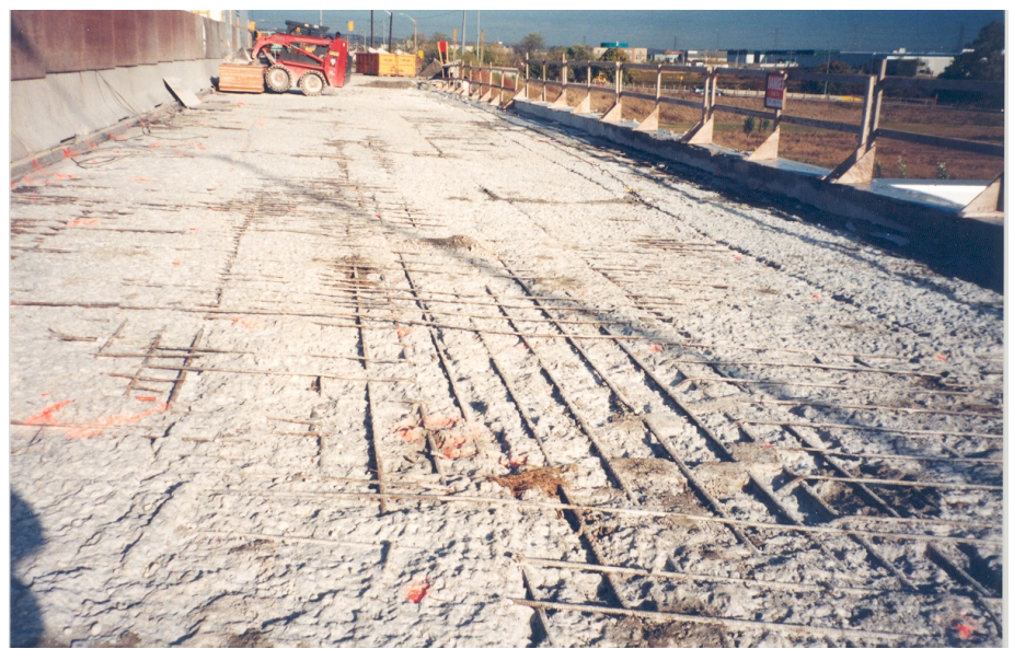
Figure 14 Top surface of deck after hydrodemolition, Hwy 25 over Hwy 401

One of the findings of the overrun study was that the use of jack hammers for partial depth removal of concrete was difficult to control and could often lead to excessive removal, further propagation of cracks and delamination, and damage of the reinforcement. There was therefore a revived interest in hydrodemolition as a systematic approach to concrete removal. The ministry first tried the technology in the late 1980's but it was not very successful due to frequent break down of the equipment. In 1998, the ministry implemented another trial project using hydrodemolition to remove a uniform thickness of concrete over the entire deck top surface. Figure 14 shows the top surface of the deck after hydrodemolition.