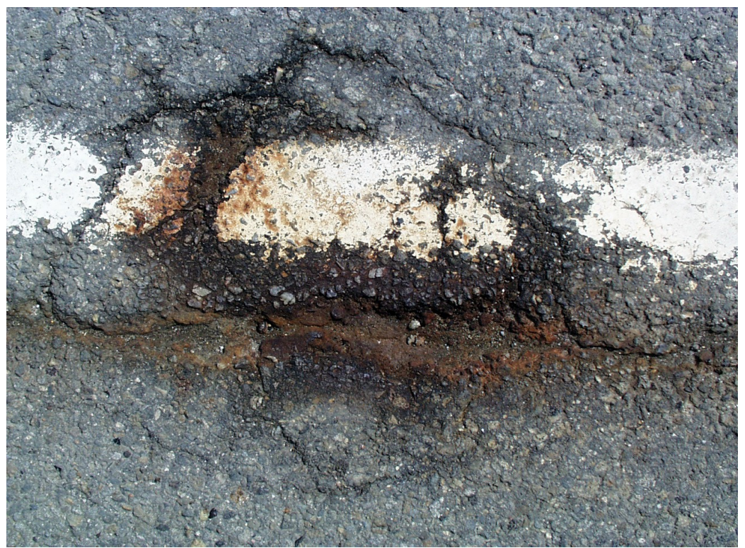
Figure 8 Asphalt deterioration at anode of conductive asphalt CP System