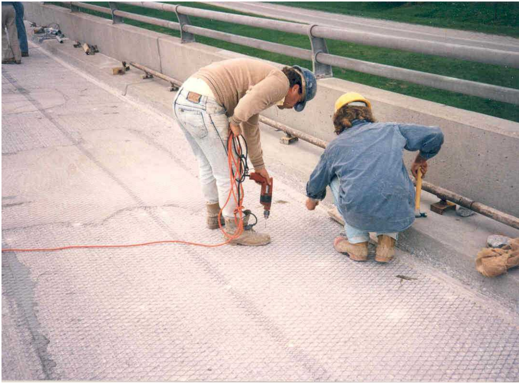
Figure 13 Titanium Mesh Anode Cathodic Protection System