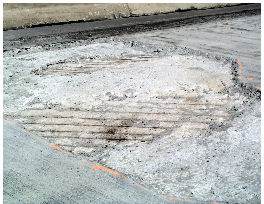
Figure 11 Localized corrosion of rebars over circular voids of PT deck