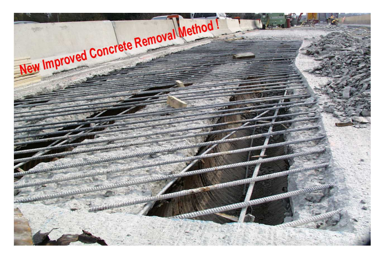
Figure 16 Excessive concrete removal of a post-tensioned deck with circular voids