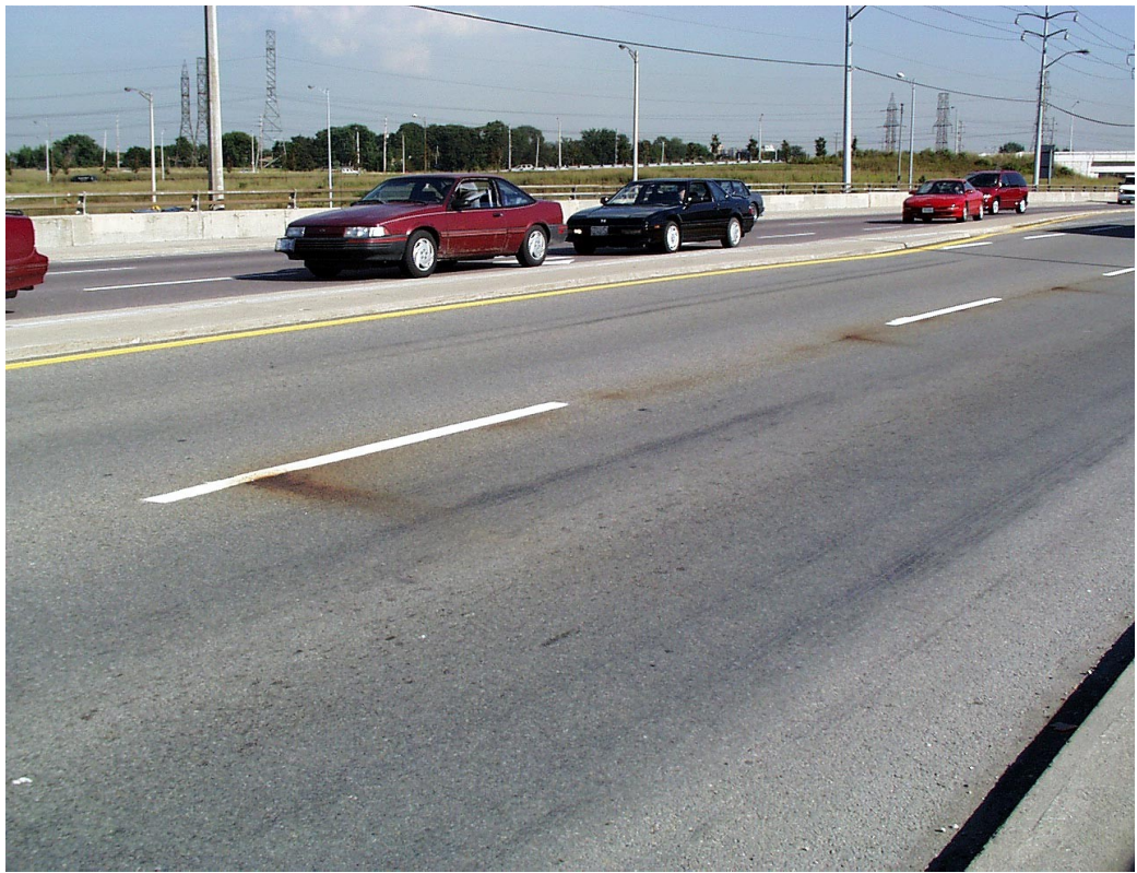
Figure 7 Rust staining at anodes of conductive asphalt CP system