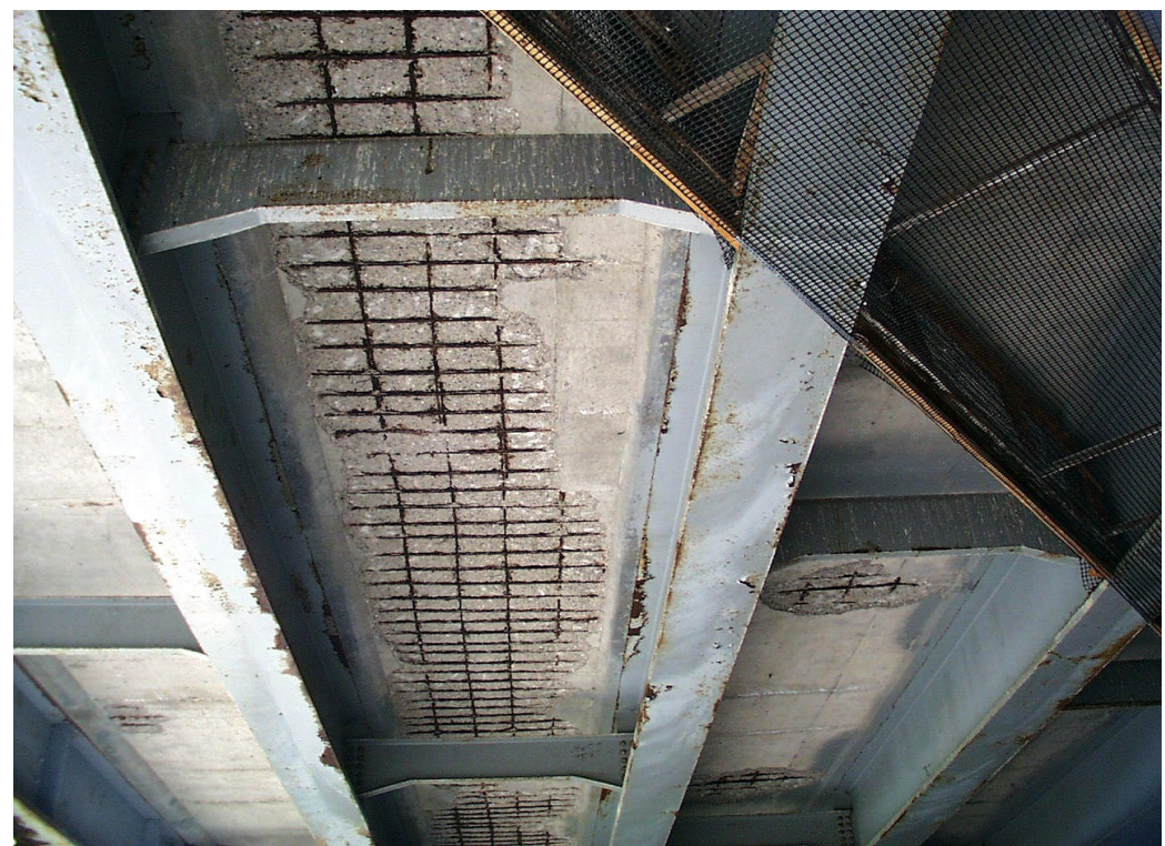
Figure 5 Soffit of Island Park Overpass, Hwy 417, taken in 2000