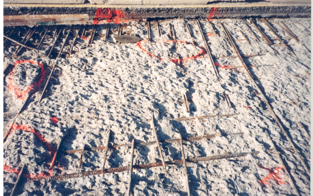
Figure 15 Condition of reinforcing steel after hydrodemolition

From a technical point of view for concrete removal, the trial could be considered a success. The performance of the hydrodemolition equipment was good with little down time and the quality of the resulting concrete surface was good. The only dissatisfaction was that the reinforcement was not as clean as we had expected and that laitance remaining on the steel could harden up if not pressure washed promptly (see Figure 15). However, it was unfortunate that the ministry also wanted to test the capability of the industry to treat the affluent on-site so that it could be discharged back to the environment. This has proven to be quite a hurdle with approval requirements from MOEE and time-consuming testing. The ministry has not used hydrodemolition again since that time due to the apprehension in people's mind regarding the stringent environmental requirements. However, this is a mis-conception, and despite this setback, the ministry still considers hydrodemolition a viable option, particularly for second generation rehabilitation of thick decks that were overlaid previously. In future applications, the contractor would likely be given the option to transport the affluent and dispose of it as liquid industrial waste rather than mandatory on-site treatment.