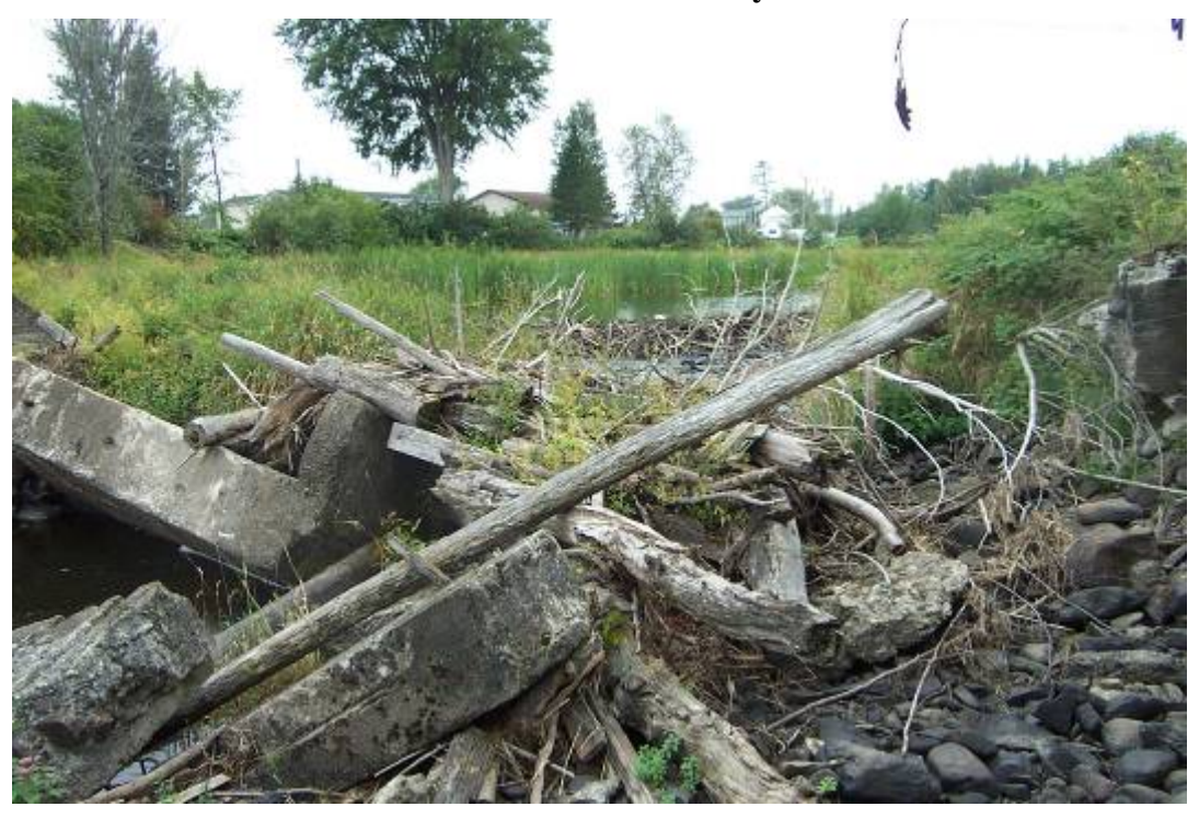
After Compensation Work Completed