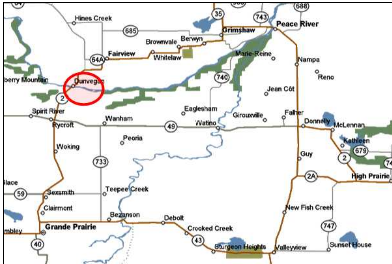
Figure 2 - Site Location