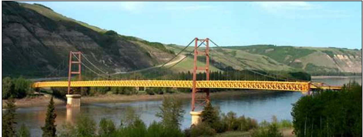
Figure 3 - Dunvegan Bridge Looking Northeast from the South Bank

The structure was originally built in 1960 to replace a ferry crossing. The deck was upgraded in 1978. Under the current contract with AE, the deck replacement design was to be completed in 2007 with construction undertaken in 2008 and 2009. The life of the replaced deck is projected to be in excess of 50 years.