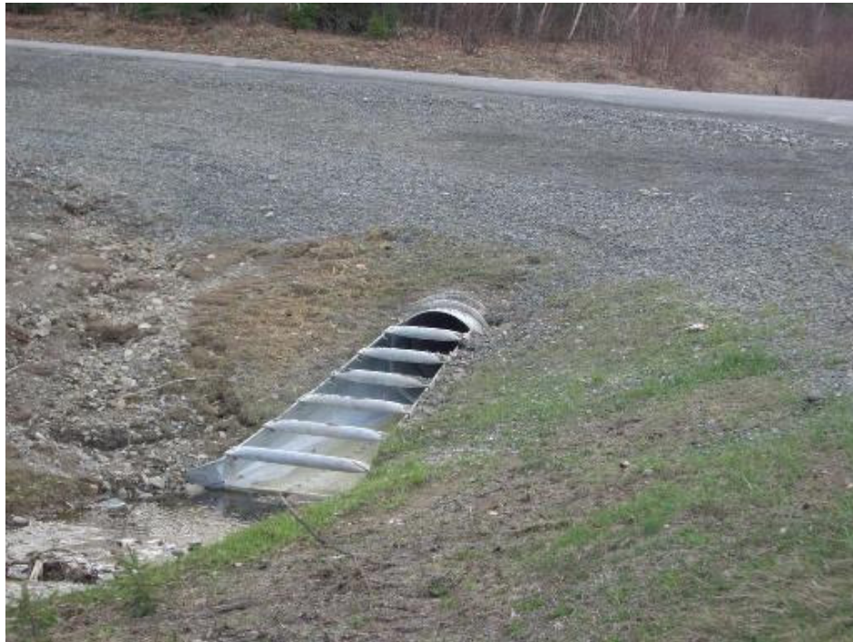
Figure 5: Typical Median Crossover After Improvements