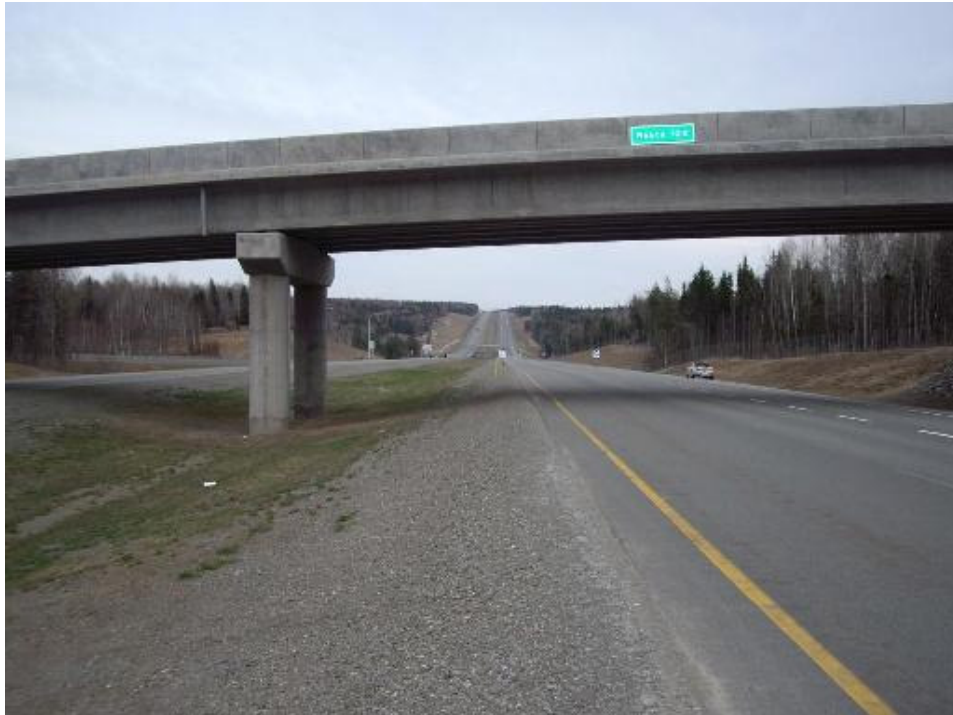
Figure 6: Unshielded Bridge Pier

This concept allows flexibility to have variable clear zones along the project. In relation to bridge piers, it allows an unshielded pier to be located outside of 10 metres on a 6:1 foreslope without requiring the installation of guide rail, which is arguably a hazard in itself, while still allowing treatments to be applied to other obstacles that can more cost effectively be improved.