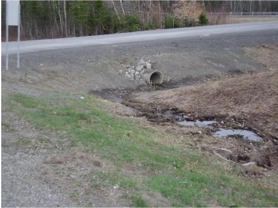
Figure 4: Typical Median Crossover Before Improvements