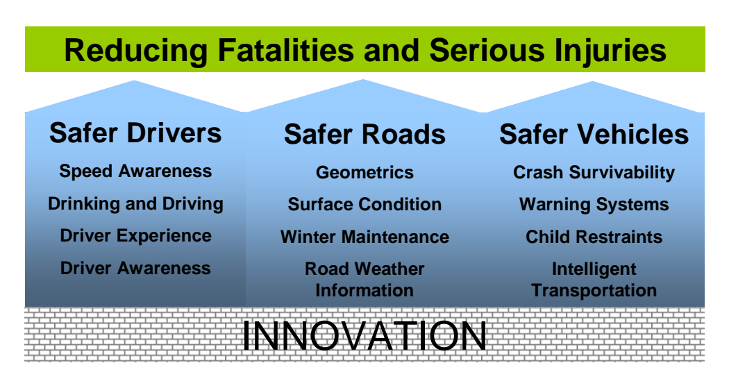
Figure 1. Innovation – The foundation for reducing fatalities and serious injuries.

While the Transport Canada Road Safety Vision 2010 program focuses on safety improvements to vehicles, intelligent transportation systems, driver attitude to speeding, reducing impaired driving, etc., improvements to the transportation infrastructure can also improve the safety of both the drivers and construction workers. Some of the possible ways to achieve these goals are outlined in Figure 1.