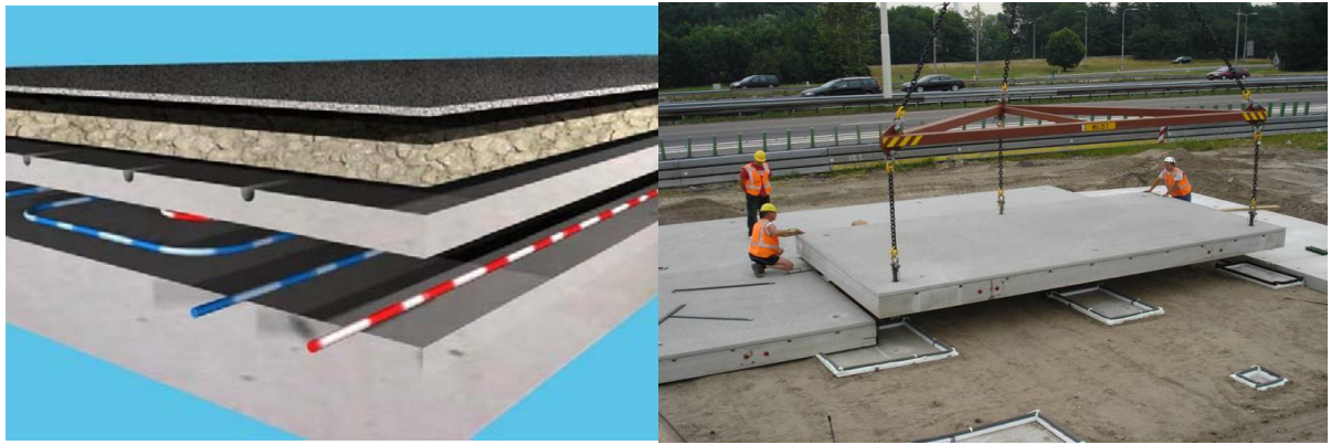
Figure 3. ModieSlab prefabricated concrete pavement.

ModieSlab (Figure 3) stands for Modular, Intelligent, Energy Slab. Prefabricated concrete slabs are anchored on a grid of piles making construction very rapid. Each Slab consists of two layers of porous concrete with different properties attached to a reinforced concrete base. Drainage channels located between the two layers of concrete are provided to channel rainwater. The same channels can also be used for road cleaning or for installing intelligent detection and signaling systems. This technology has also been used to install a piping system for cooling the roadway during the summer and warming it during the winter, keeping it snow and ice free.