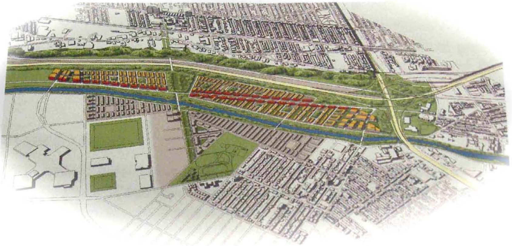
FIGURE 7.6 : PLAN CONCEPT – SCÉNARIO DE PROJET DU SITE

Transport Quebec Etude d'opportunité Complex Turcot - De La 6 Vérendrye - Angrignon - Montréal Ouest: Étude Des Solutions: Figure 7.6 Rendering by Daniel Arbour et Associés