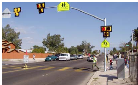
Example of a High-Intensity Activated Crosswalk (HAWK) Signal

The high-intensity activated crosswalk (HAWK) signal uses traditional traffic and pedestrian signal heads but in a different configuration. It includes a sign instructing motorists to "stop on red" and a "pedestrian crossing" overhead sign.