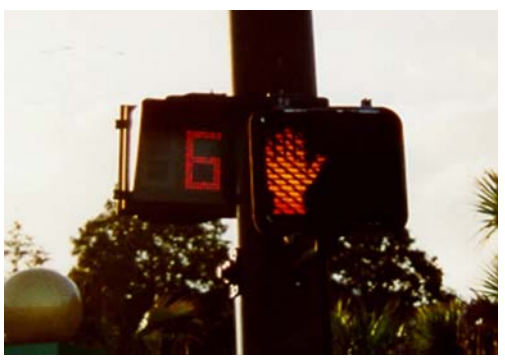
Pedestrian Countdown Signal

reduction in pedestrian injury collisions at pilot locations; in addition, about 92 percent of postinstallation interviewees explicitly said the countdown signals were "more helpful" than conventional pedestrian signals, primarily because they showed the time remaining to cross.<sup>8</sup> This is consistent with recent FHWA research that showed that a pedestrian sample strongly preferred the countdown signal to actual and theoretical versions of pedestrian signals, and that the countdown version was "most easily understood."<sup>9</sup>