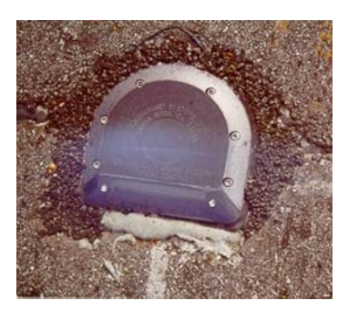
In-Pavement Crosswalk Lighting

These systems operate similar to the overhead lighting systems and activate an LED sign warning approaching drivers that a pedestrian is crossing the roadway. They have been demonstrated in Clearwater, Florida, and have resulted in increased driver yielding behavior of